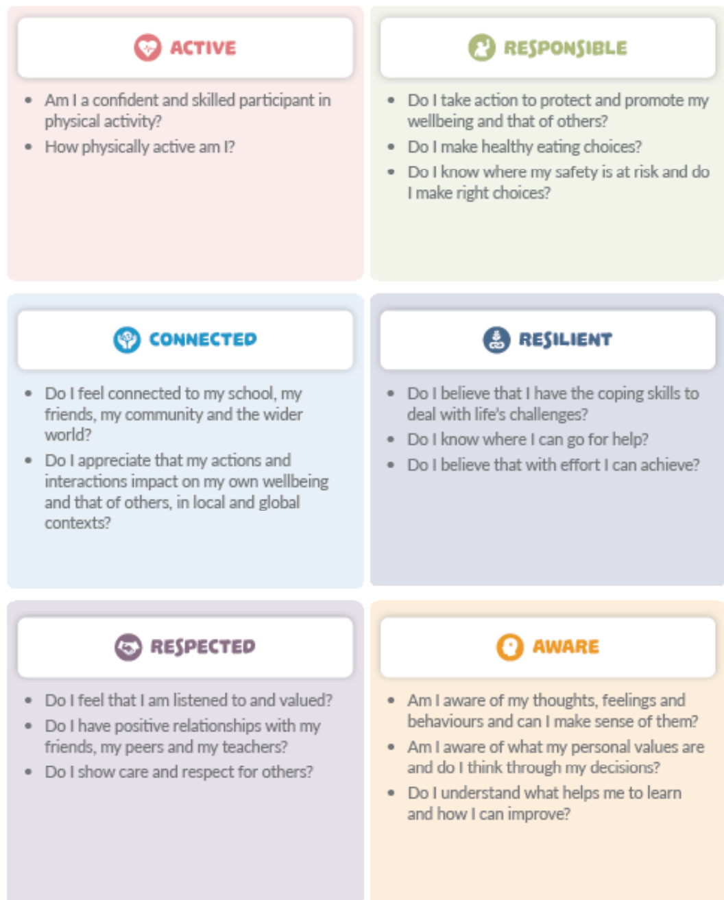
Figure 2: Indicators of wellbeing

Guidelines to support schools in planning and developing a junior cycle Wellbeing programme are available on https://ncca.ie/en/junior-cycle/wellbeing .