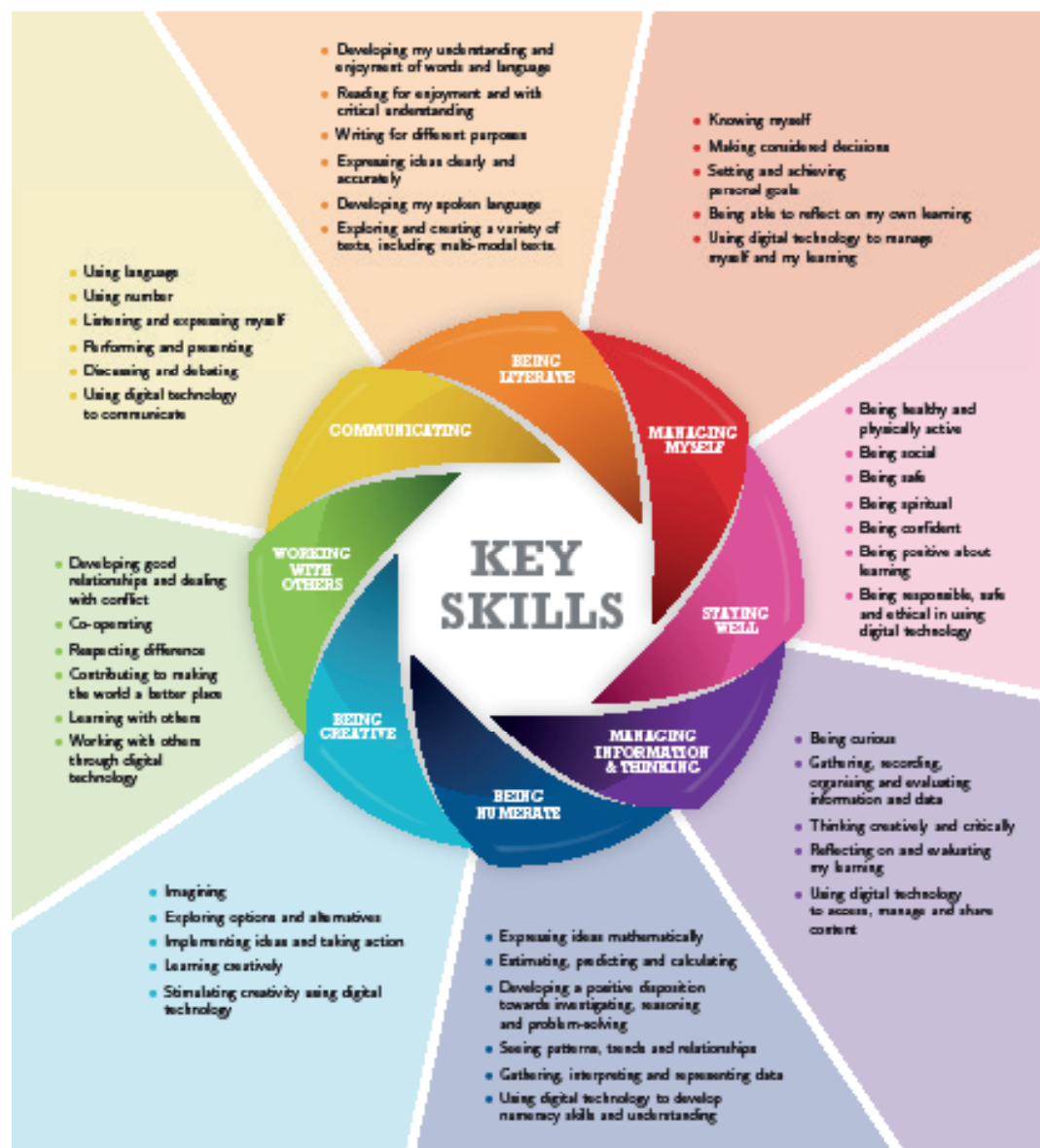
Figure 1: Key skills of junior cycle

In addition to their specific content and knowledge, the subjects and short courses of junior cycle provide students with opportunities to develop a range of key skills. There are opportunities to support all key skills in this course but some are particularly significant. The examples below identify some of the elements that are related to learning activities in Physical Education. Teachers can also build many of the other elements of particular key skills into their classroom planning. The eight key skills are set out in detail in Key Skills of Junior Cycle.