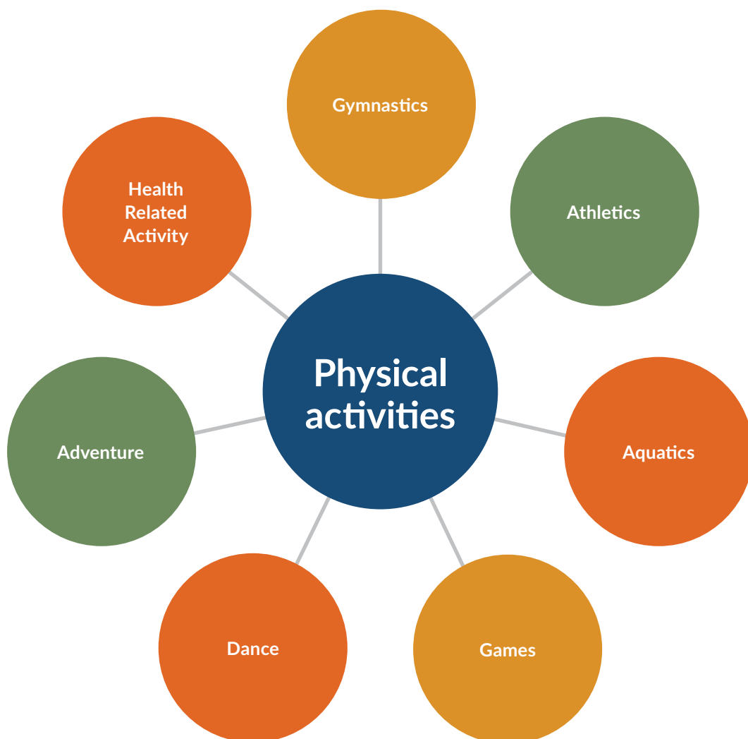
Figure 4: Physical activity areas

This specification includes seven physical activity areas representative of a range of physical activity categories. Each has particular characteristics and contributes to the attainment of the overall aim of Physical Education. The physical activities are the instrumental medium for students to achieve the learning outcomes.