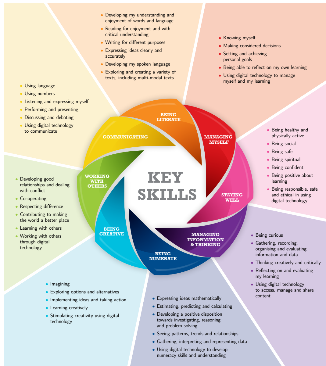
Figure 1: The key skills of junior cycle

In addition to their specific content and knowledge, the subjects and short courses of the junior cycle provide students with opportunities to develop a range of key skills. This course offers opportunities to support all key skills, but some are particularly significant. The eight key skills are set out in detail in Key Skills of Junior Cycle.