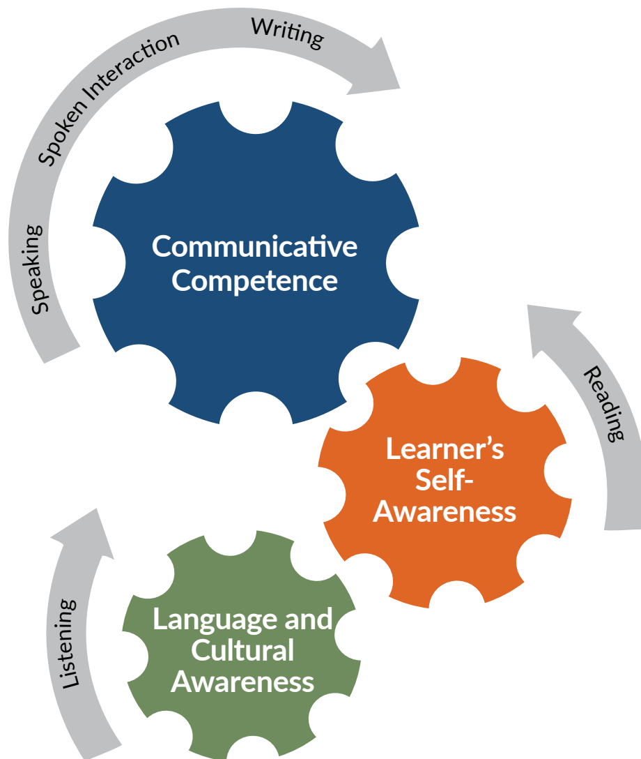
Figure 2: Course overview

This specification focuses on enhancing language and literacy skills through integrated strands: Communicative competence , Language and cultural awareness , and Learner's self-awareness . It is designed based on a minimum of 240 hours of student participation timetabled over the three years of the junior cycle.