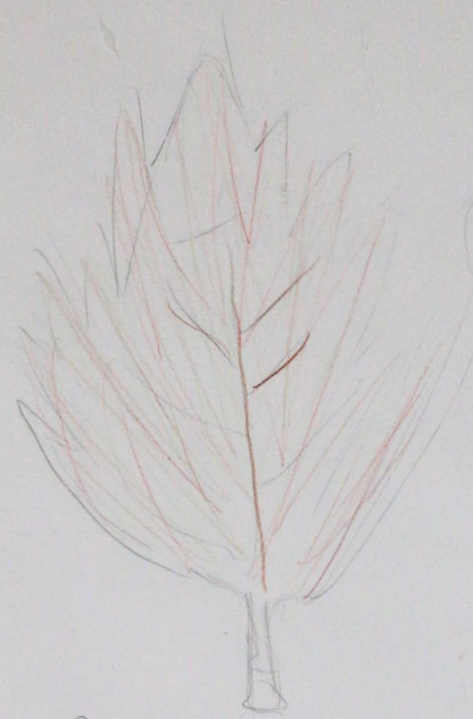
Drawing a Leaf from my head

Blind drawing is very good because you don't have any pressure you to get the drawing perfect