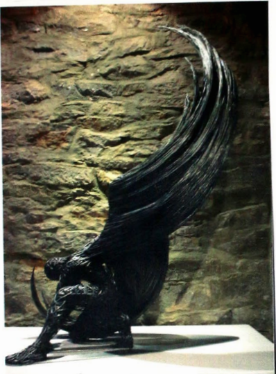
Richard Stainthorp ↗

8 Stick down on this page examples of wire sculptures you sourced and printed for homework. Write in the web site you used. Label the examples using any of the words in the Word Bank at the bottom of the page.