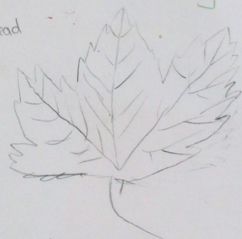
drawing with a leaf in front of me

I liked drawing with a biro but you can't make mistakes and it's harder to draw with than a pencil