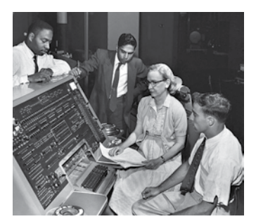
Grace Hopper and the UNIVAC

In the early years of computing technology, electronic computer could only be programmed by numbers, tape, punch cards or even manually manipulating the thermionic valves (vacuum tubes) to certain settings. After World War II, <u>Grace Hopper</u> worked on the first commercial computer called the UNIVAC. In 1953 she invented the first high level programming language, A-0, that used words and expressions to program the UNIVAC. She also created the first modern day compiler and coined the phrase BUG. A-0 evolved into