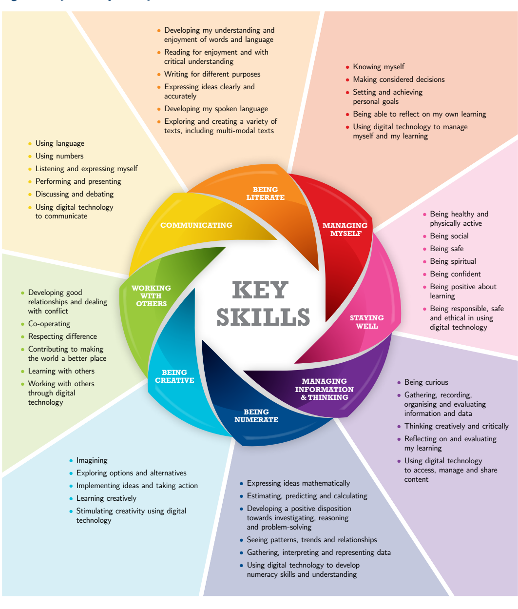
Figure 1: Key skills of junior cycle