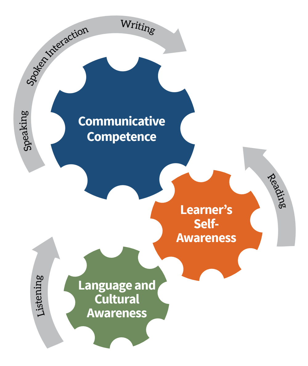
Figure 2: Course overview

This specification focuses on enhancing language and literacy skills through integrated strands: Communicative competence, Language and cultural awareness , and Learner's self-awareness . It was designed based on a minimum of 240 hours of student participation timetabled over the three years of the junior cycle.