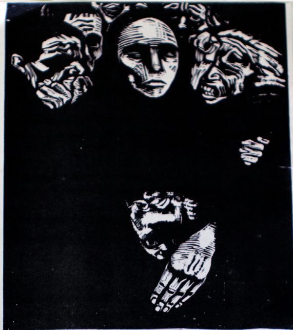
Käthe Kollwitz, The People , 1923.

Texture in all the faces, you can see all the wrinkles in the faces.