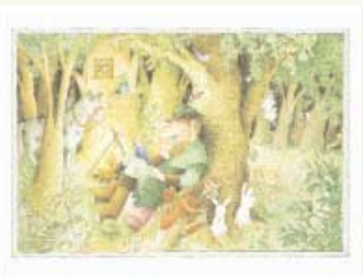
'Each Peach Pear Plum' by J. and A. Ahlberg (Picture Puffins)