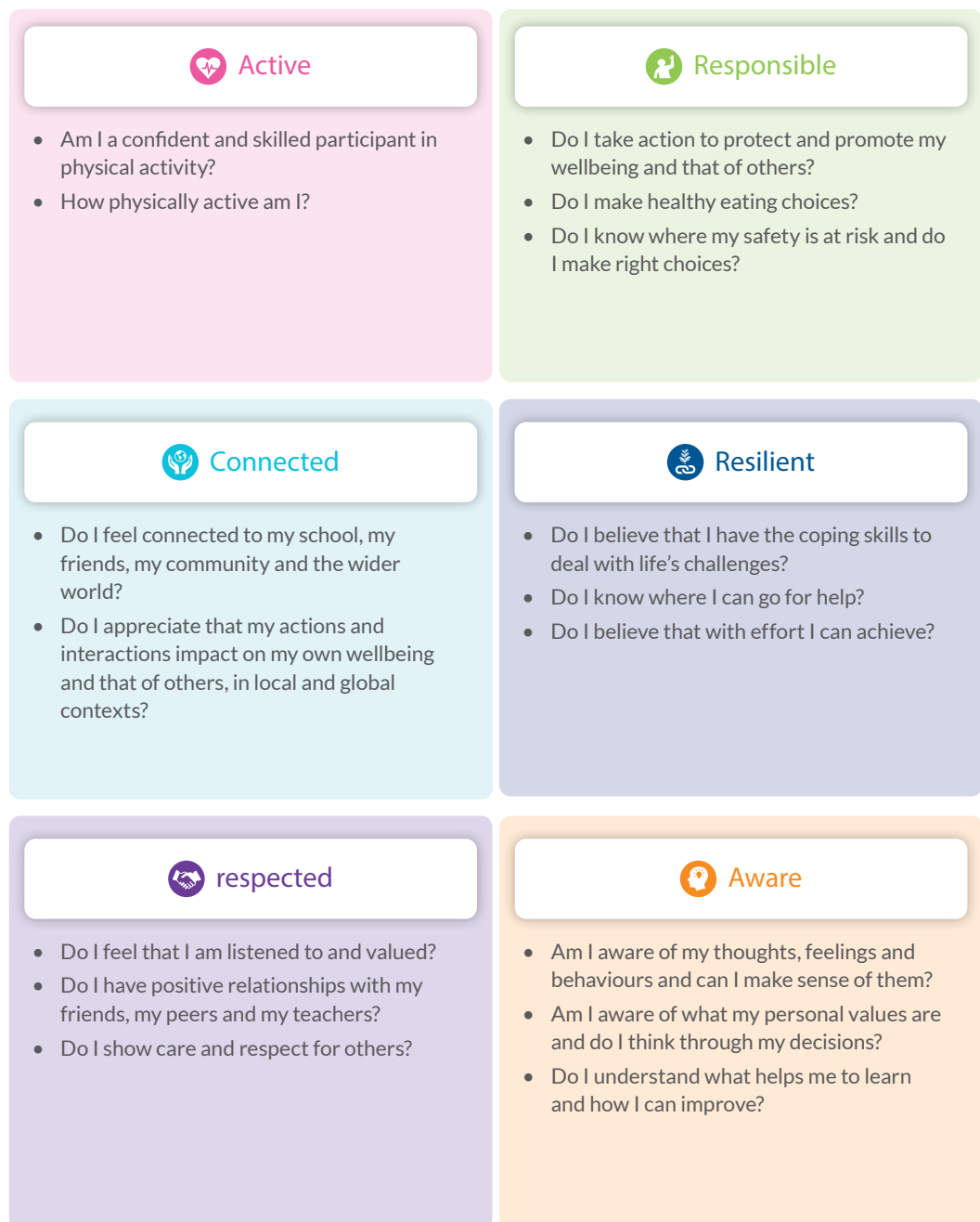
Figure 2: Indicators of wellbeing

Guidelines to support schools in planning and developing a junior cycle Wellbeing programme are available on ncca.ie/en/junior-cycle/wellbeing .