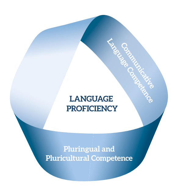
Figure 4: The integrated and interdependent nature of the strands and elements within this specification

In designing the strands, elements and learning outcomes for this specification, the following concepts and ideas were given particular attention: